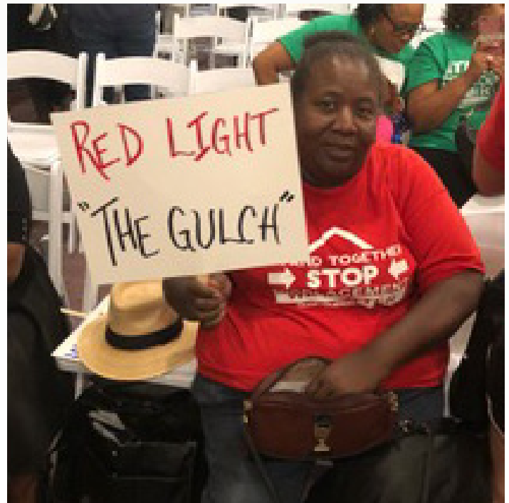
The struggle for the future of downtown Atlanta continues.

crowd that filled two large rooms. Some 12-15 MADSA members attended, in solidarity with the Housing Justice League and other community folks, both organized and individuals, who made their voices heard throughout the proceedings though we were only allowed to submit written questions – not public comments – and only a small number of mostly safe questions were answered by the officials. For more re MADSA's position, see 9/27 blog post at madsa.ga . On Nov. 5, the City Council voted to approve the development plan, though it is in litigation as of this writing.