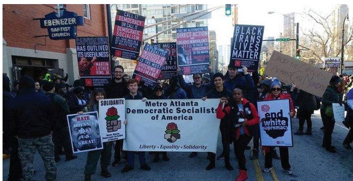
MADSA members at the 2017 M.L. King March

Convene at 1:15pm at Peachtree and Baker Streets, downtown Atlanta. March behind MADSA’s banner with the labor contingent, celebrating MLK’s 90th birthday and the continuing struggle for justice.