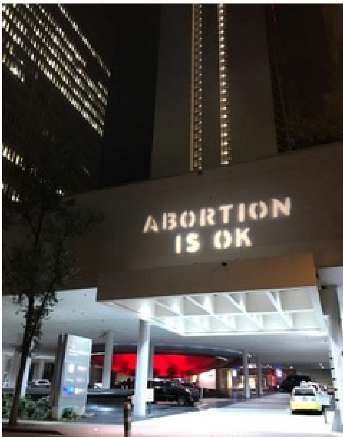
Flashing for reproductive rights.