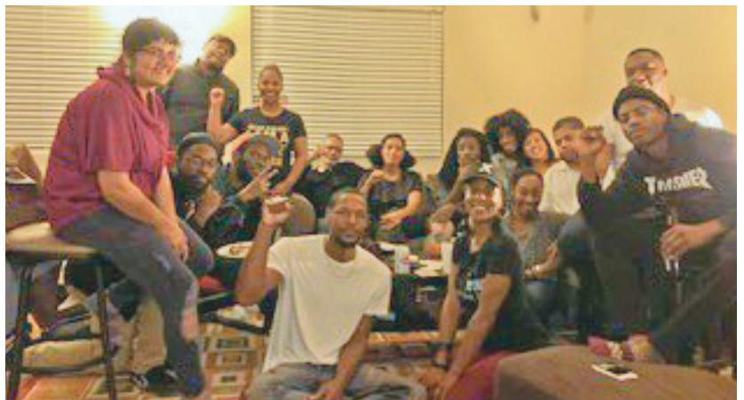
MADSA AfroSocialists and comrades.