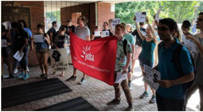
Ga. Tech YDSA mobilized vs. Miseducation Secretary Betsy DeVos.

calls to enact College For All, to forgive student debt, and to decommodify education.”