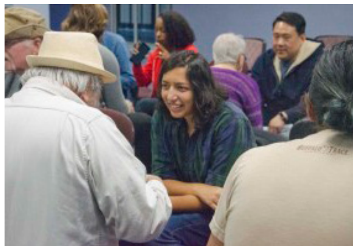
"Socialist speed-dating."

Finally, at our last three meetings we enjoyed "socialist speed dating" sessions, in which rotating pairs of attendees get to know and learn from each other by briefly sharing our political histories and our understanding of key socialist concepts. In December the subject was Medicare for All - a national DSA priority and the focus of a planned MADSA canvassing project.